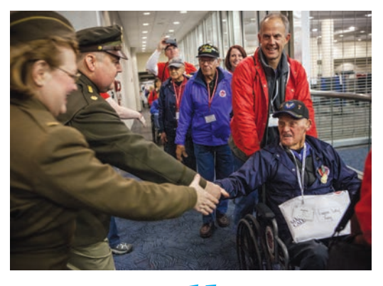
15 War Hero Takes Flight

CUW's School of Pharmacy resident providing a necessity in an underserved community.