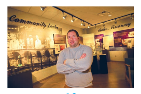
10 Filling a Need

A student's battle with cancer inspires others to not give up their fight.